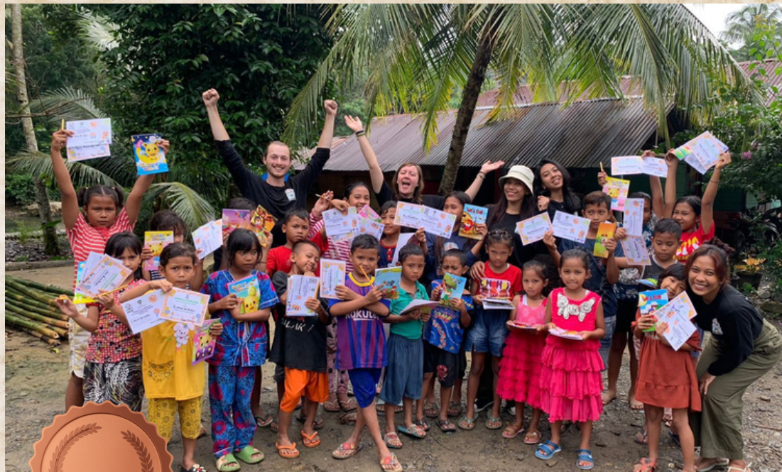
Our conservation and Education team at Batu Katak

We've been getting festive here at the Trust Hub. Our staff and volunteers have various different religious beliefs and cultural backgrounds so it's a special time when we get to celebrate with one another to honour and learn about each other's traditions.