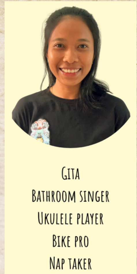
GITA BATHROOM SINGER UKULELE PLAYER BIKE PRO NAP TAKER

Q: Tell me a favourite moment from your classes in the last few weeks. "To see the adults (from business class) struggle with the business assessments but then achieve it."